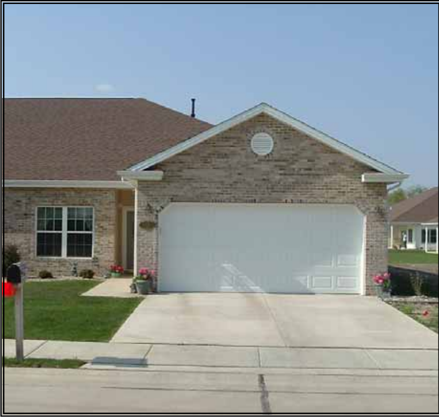
Picture is of a similar unit. Actual unit is under construction.