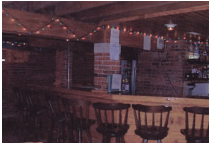
Interior - Kitchen